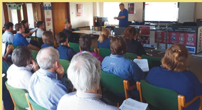
A training event held for Veterinary Practices in October regarding the Annual Health and Welfare review.